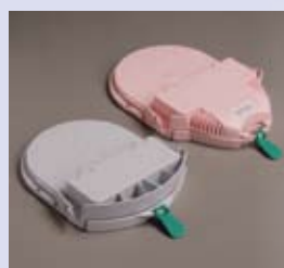
Pad-Pak™ and Pediatric-Pak™, with pre-attached electrodes

Low cost of ownership. Cartridge typically has a shelf-life of 3.5 years from date of manufacture, offering significant savings over other defibrillators that require separate battery and pad units.