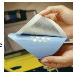
Patented RescueReady daily self-test system tests for pad functionality and connection to the AED

To learn more about the best choice in AEDs, visit our website www.aedeverywhere.com , or email aed@aedeverywhere.com , or call 1-877-751-5300.